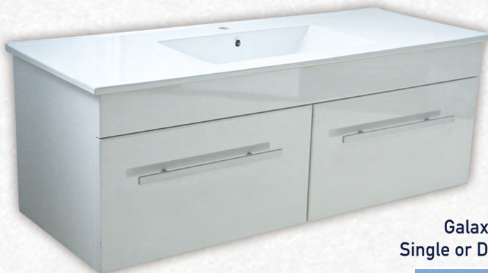
Galaxy 1200 Single or Double Basin