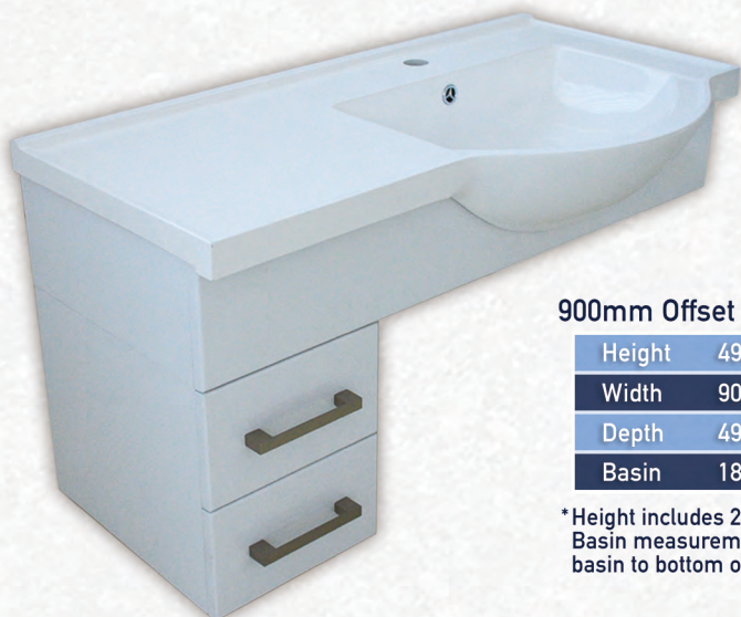
900mm Offset Basins