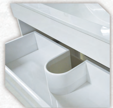
Drawer Finish for Galaxy & Meteor Models