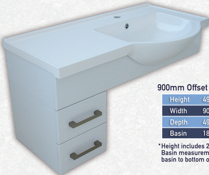
900mm Offset Basins