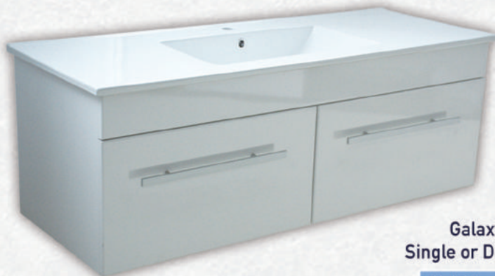
Galaxy 1200 Single or Double Basin

Drawer Finish for Galaxy & Meteor Models